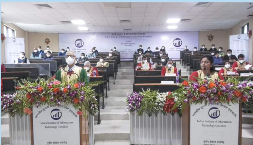
Third Convocation of IIIT Guwahati