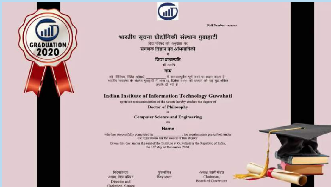
Virtual Certificates at Third Convocation of IIIT Guwahati