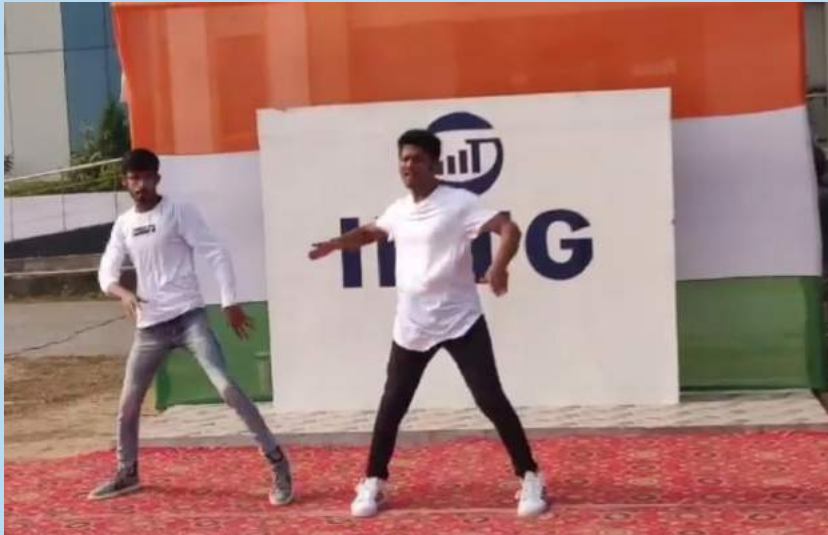
Republic Day 2021 at IIITG