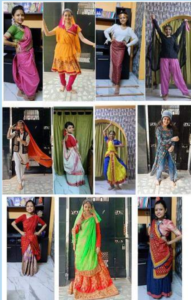
Republic Day 2021 Online Event