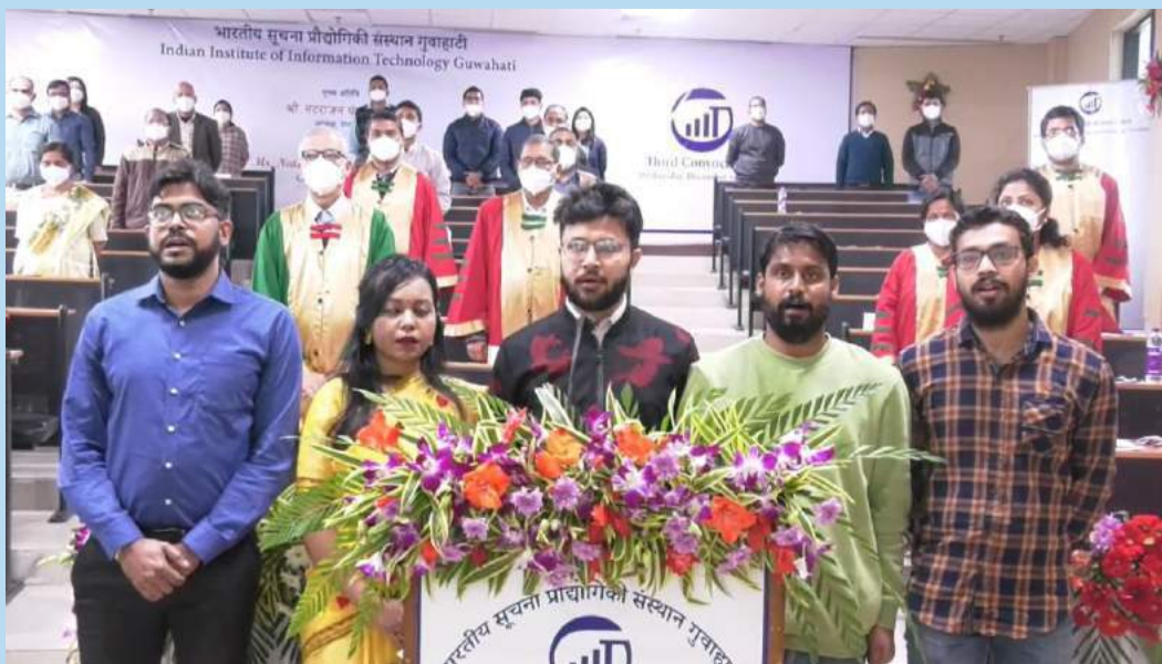
Third Convocation of IIIT Guwahati